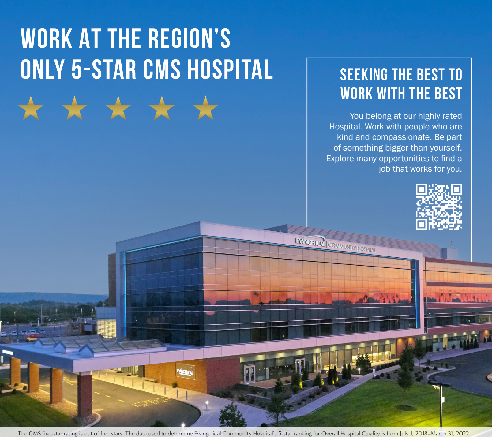
For more information on the star rankings, visit https://www.medicare.gov.