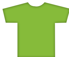
PATIENT ACCESS Bright Green