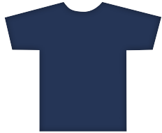
REGISTERED NURSES Navy

In order to help you identify the roles of our team members, the Hospital uses standardized uniforms for departments who interact with patients and guests on a regular basis.