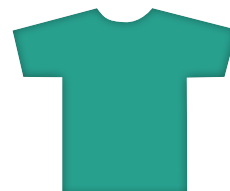
NUTRITIONAL SERVICES Mauve Blue