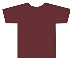
PLANT ENGINEERING Wine