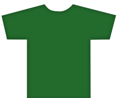
ENVIRONMENTAL SERVICES Hunter Green