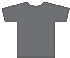
REHABILITATION SERVICES Pewter