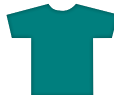
LABORATORY SERVICES Caribbean Blue