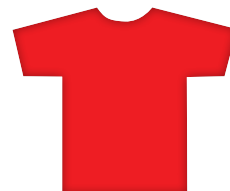
VOLUNTEER SERVICES Red