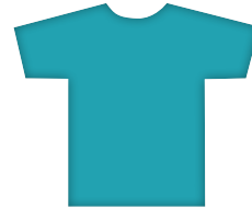
NURSING SUPPORT Ceil Blue