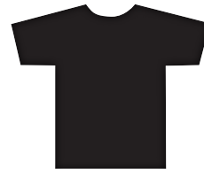
IMAGING SERVICES Black